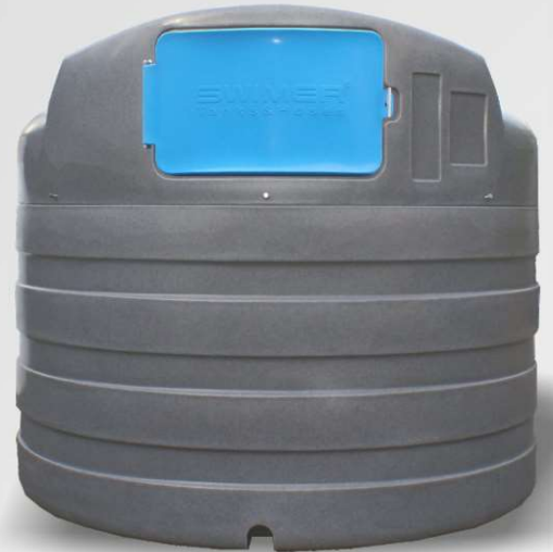
SWIMER BLUE TANK 1500 ELDPS SW-100792