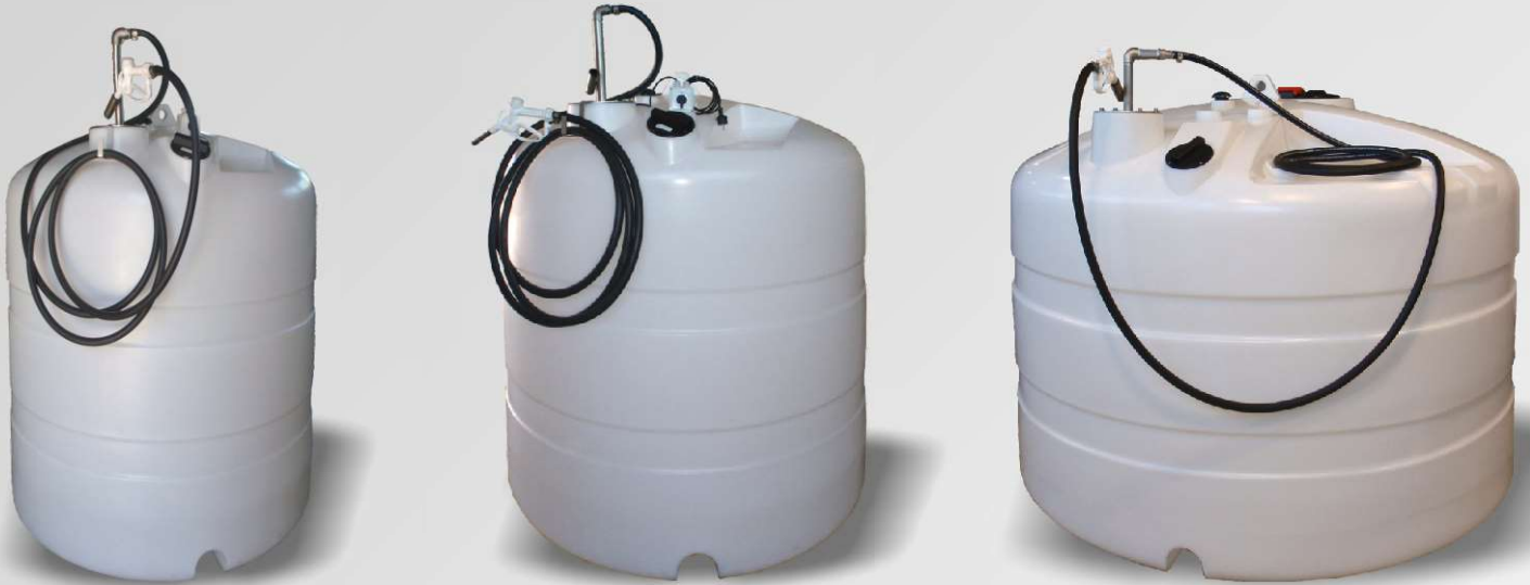
SWIMER BLUE TANK 1500 ELJP SW-100790